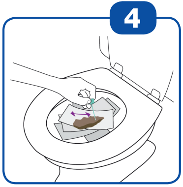
Collect a sample by scraping the green stick over the surface of the bowel movement.