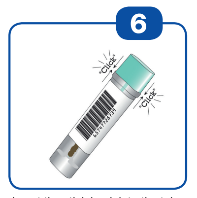
Insert the stick back into the tube and push the green cap close (click the green cap on tightly). Do not repeat, do not reopen.