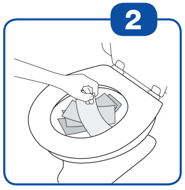
Place collection paper or several layers of toilet paper inside toilet bowl on top of water. Deposit stool sample on top of paper.