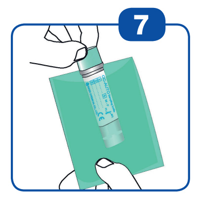
Shake the closed sample bottle vigorously up and down several times and place the sample bottle in the green plastic bag.