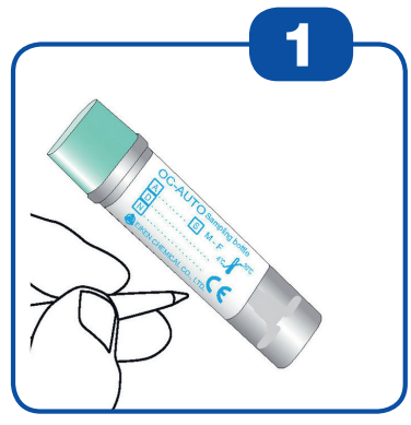
Write your name and date on the sample bottle.