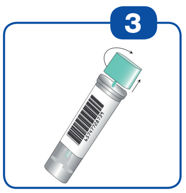
Open sample bottle by twisting and lifting the green cap.